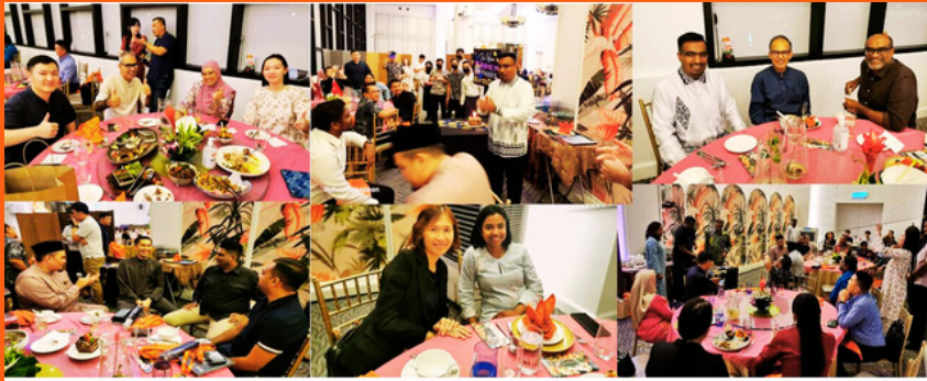
Hari Raya Celebration with Partners and Board Of Directors + Heads of PMI.