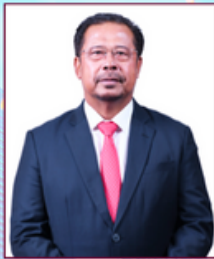
YB. DATO' SRI ABDUL RAHMAN BIN HAJI MOHAMAD Deputy Minister of Works, Malaysia